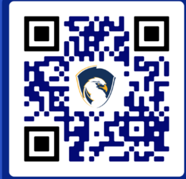
OPA Family News