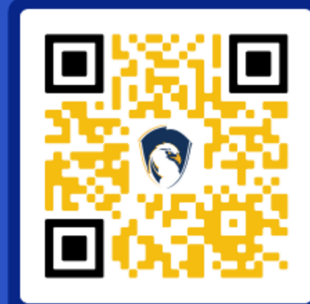
OPA Eagle News