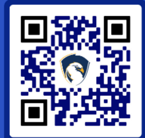
OPA Family News