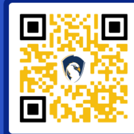
OPA Eagle News